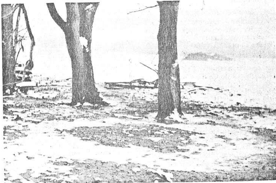
Snow covered ring photographed one month after a bright "toad-stool" shaped object had taken off from behind a barn on the Johnson farm near Delphos, Kansas - 2nd November, 1971.